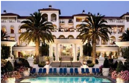
Sheraton Kigali – Rwanda