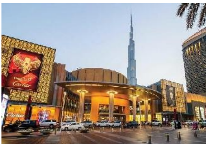
The Dubai Mall