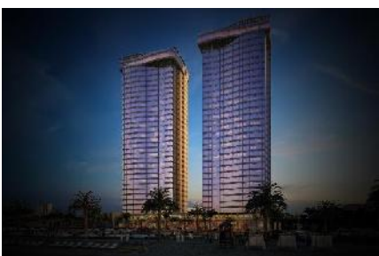
Farsi Towers – KSA