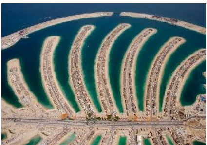
1340 Villas – Palm Jumeirah – Dubai