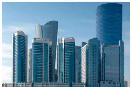
Hydra Avenue Towers - Abu Dhabi