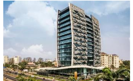
Kings Tower - Lagos, Nigeria