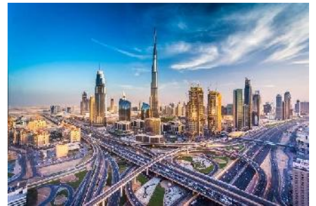
Downtown - Dubai