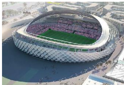
Hazza Bin Zayed Stadium - Al Ain