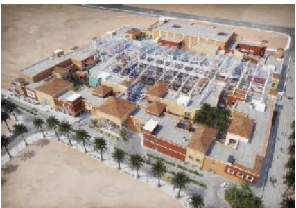
Souq Bab Al Madina – Jordan