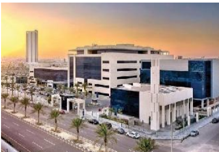
Al Mowasat Hospital - KSA