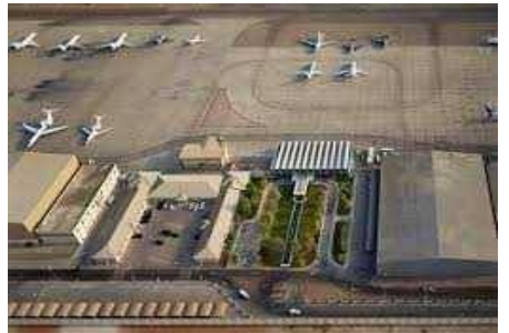
Al Bateen Air Base - Abu Dhabi