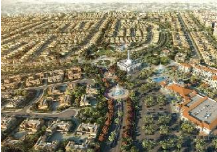
2062 Villas - Villa Nova at Dubai land