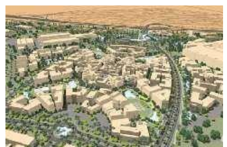
Dubai Silicon Oasis