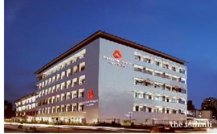
Aga Khan Hospital – Tanzania