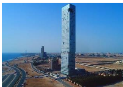
Golden Tower – KSA