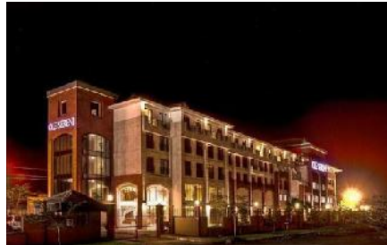
Ole Sereni - Nairobi, Kenya