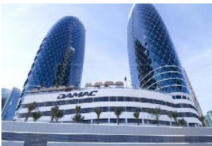
Park Towers – Dubai