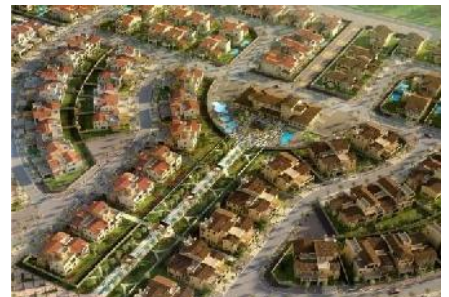
Bloom Gardens - Abu Dhabi