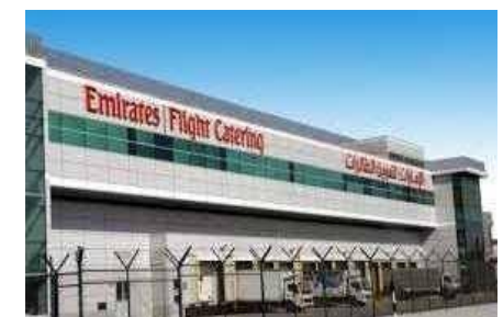
Emirates Flight Catering - Dubai