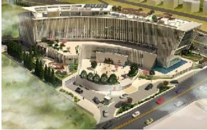
Hikma Headquarter – JORDAN