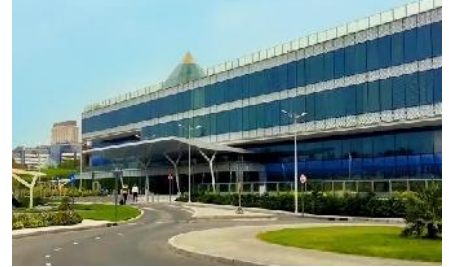
Al Jalila Children's Hospital - Dubai