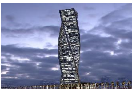
Al Majdoul Tower – KSA