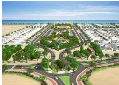
410 Villas - Al Mirfa Beach Housing - Abu Dhabi