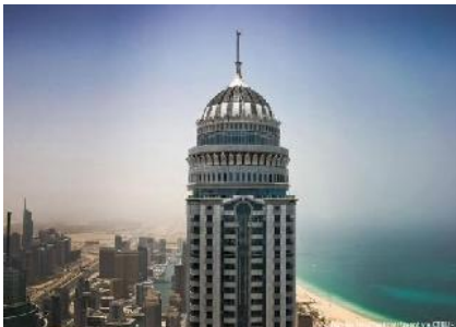
Princess Tower - Dubai